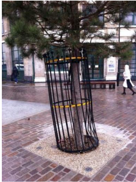
Previous barrier damaged by vehicle